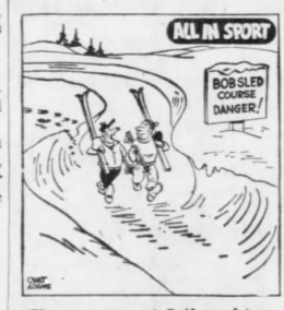
"For a moment I thought we were lost, but this path probably goes right to the lodge!"

FIS amateur—One who accepts money for teaching but doesn't advertise his