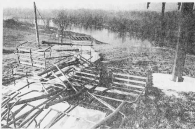
This double chair lift will make getting back to the top of a ski run at Oak Highlands easier this

During the summer months, the area continues to provide recreation for area residents. It is the site of a hydrotube water slide.