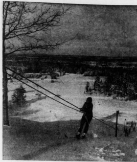
ENTHUSIAST UNDER TOW ON GRAYLING HILL. Resort offers three powered tows, two huge ice chinks