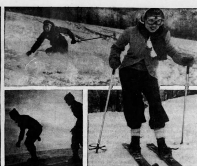
WINTER WEEK-ENDS WILL BE ACTION-PACKED IN MICHIGAN. Resort owners of the State are giving Eastern proprietors a run for their money