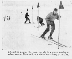
Silhouetted against the snow and sky is a group running a slalom course. There will be a slalom race today at 10 a.m.