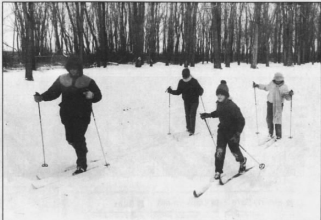
Cross-country skiing can be as close as a golf course or park in your own city.

It has a day lodge with snack shop and ski rentals. It's open noon to 9 p.m. Thursdays and Fridays and 9 a.m. to 7 p.m. Saturdays and Sundays.