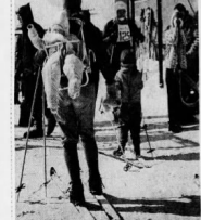
... carries skiers to the top of Mount Mansfield at Snow Trails ski area.

One Day Trips It is in the first area that is of prime interest to the skier of the Greater Cincinnati area. The two slopes are the Mount Mansfield and the Mount Sterling slopes.