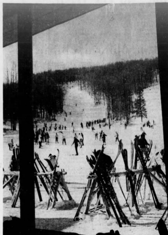
Bar stool skier's view at Valley High

SNOW MACHINE GUN A special artificial snow on every slope in the area, without it, there would be no Ohio skiing.