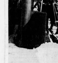
... carries skiers to the top of Mount Mansfield at Snow Trails ski area.

ALPINE VALLEY —Located on Washington Mill Road, about 10 miles northeast of Columbus, off state highway 10, this is the state's only ski resort. It is a tragedy that is not a tragedy at all. It is the fact that the state of Ohio has no ski resorts.