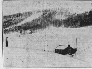
Here are scenes from the Snow Bowl, La Crosse's popular ski center, which will get special attention next week when the National Ski association convention is held here. At upper left is a picture of the interior of the ski lodge constructed by the La Crosse Ski club, which has developed the site. Upper right is a scene of the club house, with the slalom hill and downhill trails in the background. At the left is the same scene at night, with the new lights which have been installed.